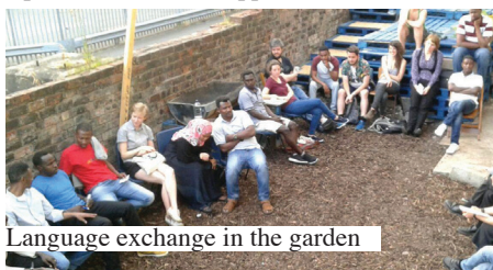
Language exchange in the garden

The garden is open but hibernating in the wet winter! Well done everyone who contributed, it is going to be great again in the Summer. Last year the garden hosted BBQs, meetings, direct action training, sunbathing and language exchange. Got ideas for the garden space? make them happen!